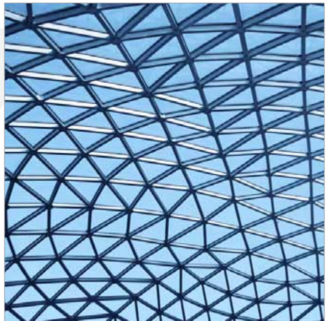
→ Construction Industry