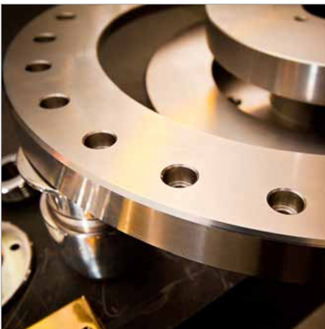
→ Value Driven Quality

Our policies, procedures, and processes are not only used to ensure the quality of our products, but are part of our culture – a culture which is based on high-quality standards.