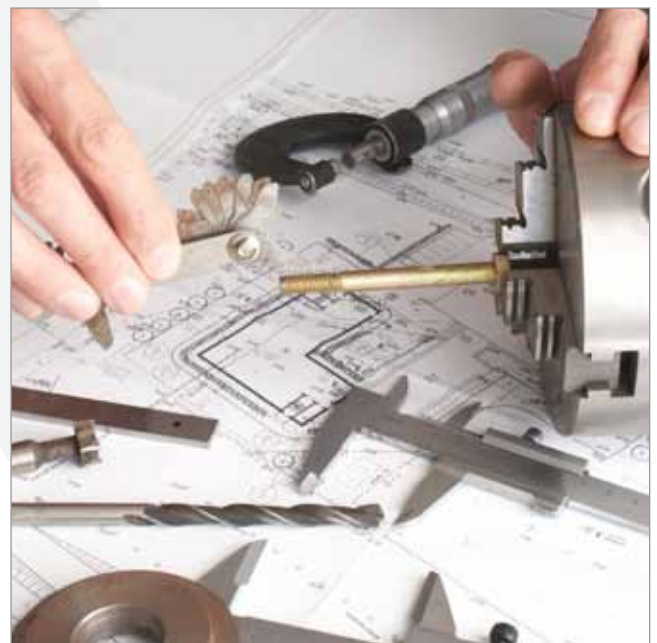
→ High Quality Standards